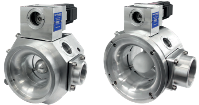
VariFuel2 MOTORTECH AIR/GAS MIXER VariFuel2+ MOTORTECH AIR/GAS MIXER

VariFuel2/2+ repair kits will be available until 2028.