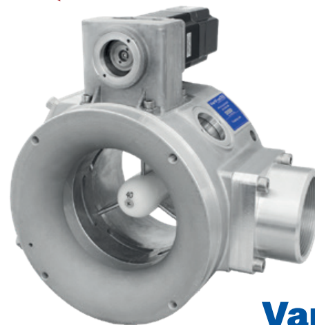
VariFuel3 MOTORTECH AIR/GAS MIXER

Note: If VariFuel2/2+ Air/Gas mixers are replaced in the field, a new AFR-controller mapping may be required due to improved fuel ring design!