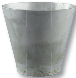
Heat Shield P/N 19.60.022