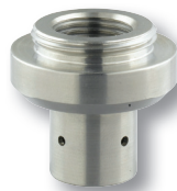
Weld Hub P/N 19.60.023

To increase lifetime of these critical sensors, there is a stainless steel hub available, which is welded to the exhaust pipe and takes the sensor out of the dirty exhaust gas stream. A heat shield can be screwed on top of the weld hub. This way the sensor does reach directly into the heat shield protects the sensor against transient temperature from the hot exhaust manifold.